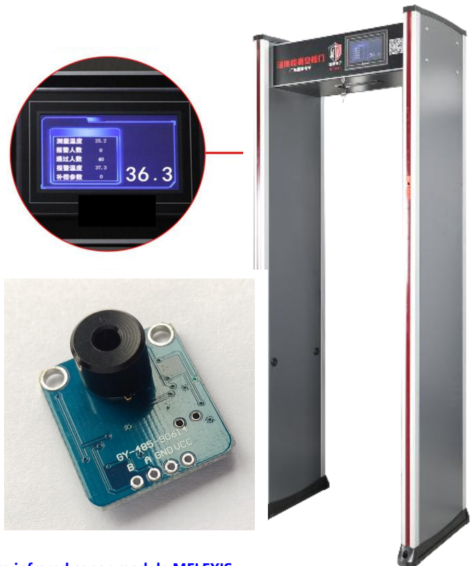
Temperature infrared sensor module:MELEXIS